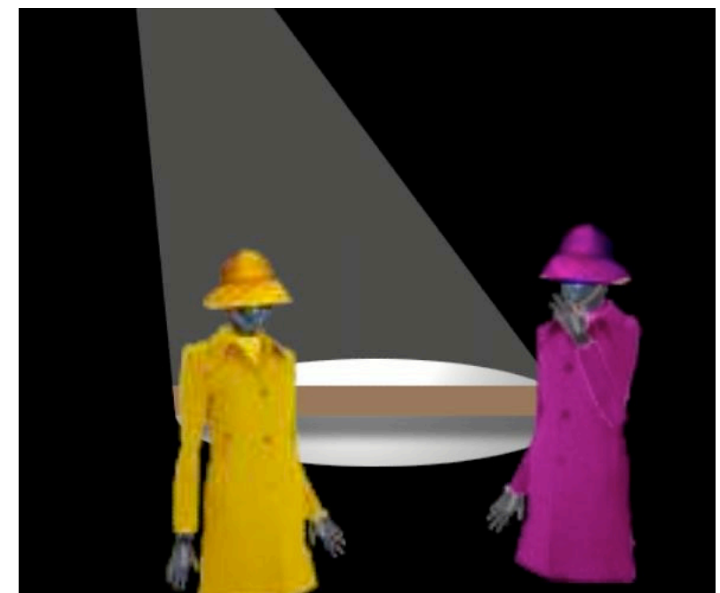
Come and Go by Avatar Body Collision will be restaged; it premiered at 070707, the first UpStage Festival, held in 2007

From 5-11 December, a retrospective of shows from past UpStage festivals will be presented under the title "Walking Backwards into the Future". Revisit old favourites, catch shows you missed the first time around, and celebrate six years of online real-time creativity!